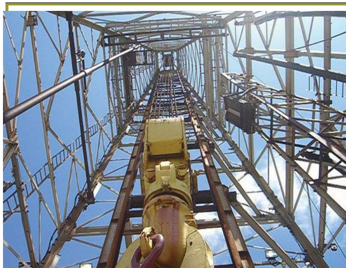
Ocean Star Field Trip—view from the derrick floor