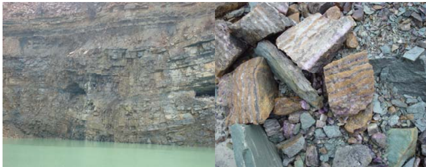
Photos of Hastie Quarry

Hastie Fluorite Quarry, where, if we can get permission to enter, we can collect some gorgeous fluorite pieces: