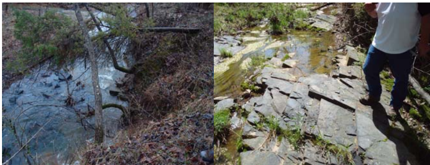
Photos of Hicks Creek at Hicks Dome

Hicks Dome, the site of an almost-volcano, and nearby exposures of the New Albany Shale: